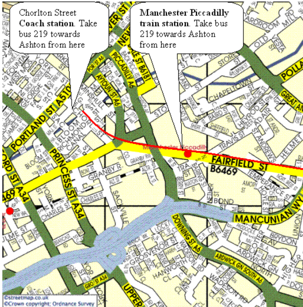
Figure 1: Location of picking bus 219 either from the Coach Station or from the Train Station (follow to Figure 2)

SEA MARK shown in the last map, make sure you get off at the ALDI (food super store) stop which you will see immediately after the green side street stop.